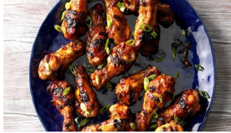
TASTEOFHOM.COM 55 CHEAP GRILLING IDEAS YOU NEED TO TRY BEFORE SUMMER ENDS

https://www.tasteofhome.com/collection/cheap-grilling-ideas/