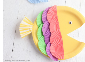
Kids art, craft and activity ideas- Messy Little Monster

What a cute craft to go with a great book - Rainbow Fish!