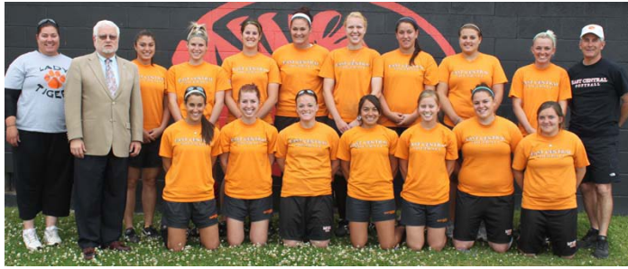
CONGRATULATIONS TO THE 2010 LSC NCAA RUNNERS-UP - ECU LADY SOFTBALL TEAM