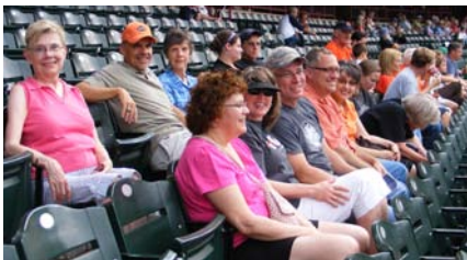
ECU's Night out at the Redhawk's Game.